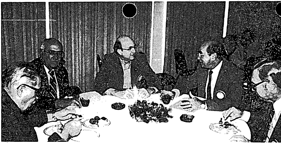
Photo above: One of the many tables of Space Center Rotarians and guests who enjoyed the informality of the holiday season style meetings.